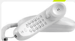
STANDARD POTS PHONE