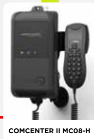
COMCENTER II MC08-H

also supports wireless phone systems and/or PBX