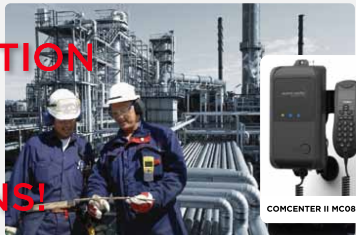
COMCENTER II MC08-H

COMPLETE SOLUTION FOR INDOOR SATELLITE COMMUNICATIONS!