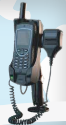
PUSH TO TALK DOCKING STATION

Extend and enhance satellite communication through a clear and simple channel of near instant Push-To-Talk communication that opens a host of applications.