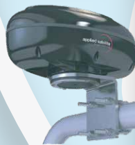
ASE FIXED STATION TERMINALS

Satellite communication that meet the demands and specifications for industry critical voice and data applications.