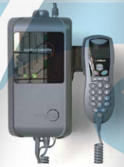
ASE RESILIENCY SOLUTIONS

Satellite communication that remains operational even when land-based communication has been lost, overwhelmed, or is unavailable.