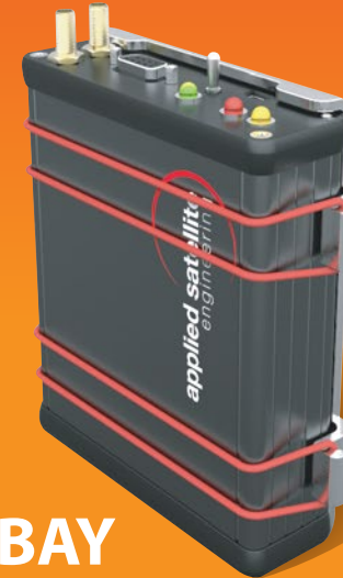
BAY (External Antennas)