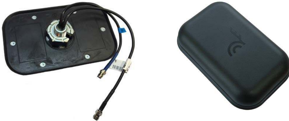
BSN AN-100107 Antenna

It is ideal for those applications that require durability, compact size, covert installation and ruggedized construction. DO NOT PAINT THE ANTENNA