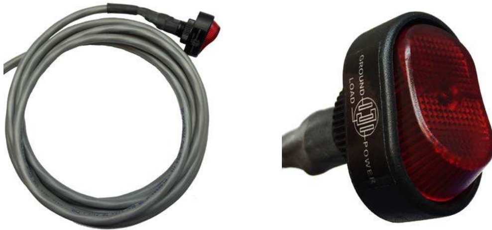
D411 Quick Position cable and switch

When the Quick Position switch is in the ON position the LED inside the switch is ON. When the Quick Position switch is in the OFF position the LED inside the switch will be OFF.