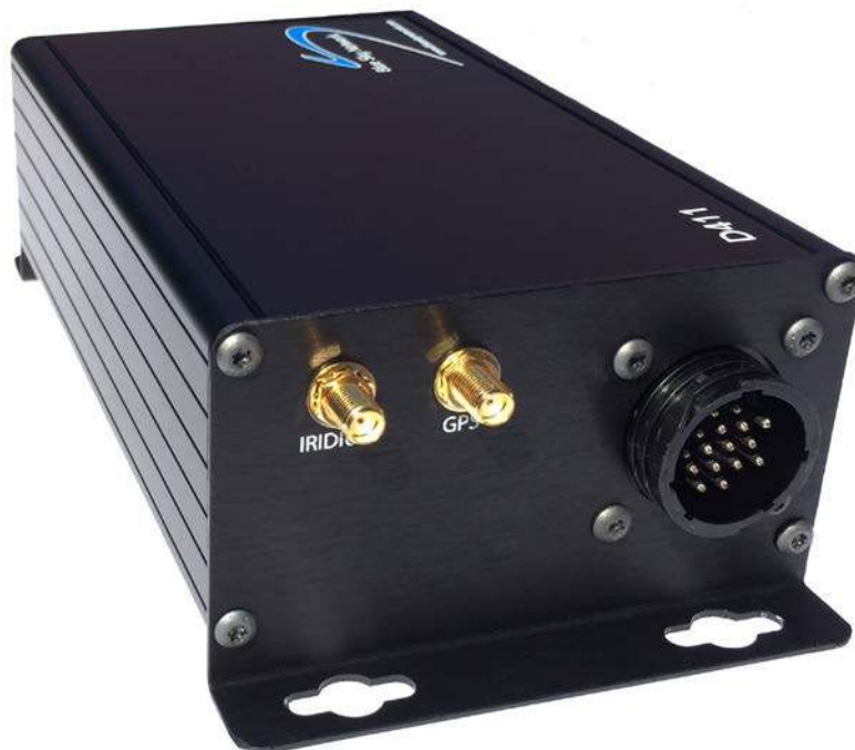
Blue Sky Network D411

All data services are managed by the customer through our web-based SkyRouter portal. SkyRouter offers global asset tracking, account management features, such as user authorization, asset settings, messaging and billing information. For more information on SkyRouter please visit: http://www.blueskynetwork.com