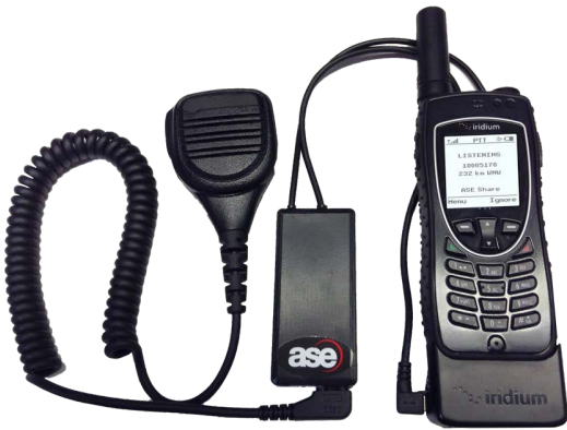
(Shown with 9575 Handset and dongle-not included)