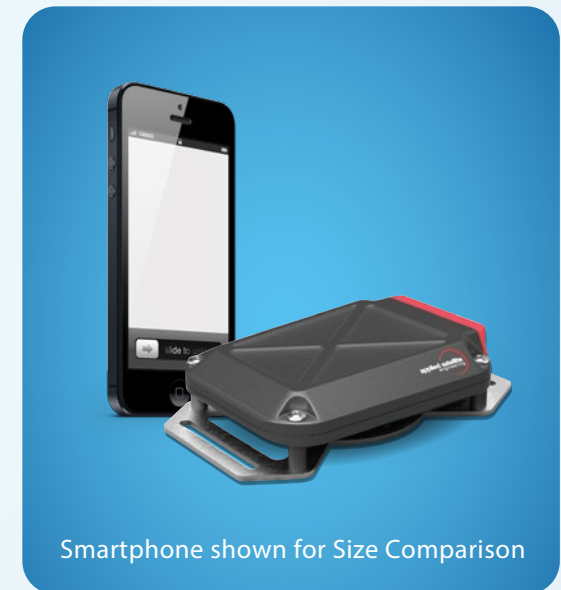
Smartphone shown for Size Comparison