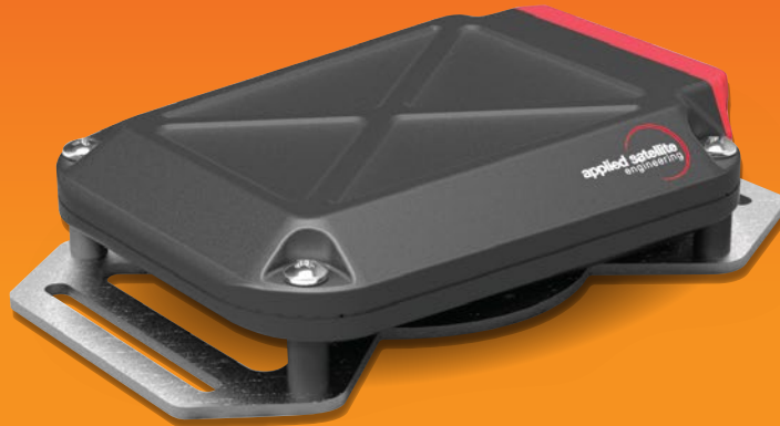
TMC (Internal Antennas)