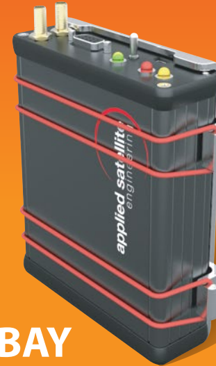
BAY (External Antennas)